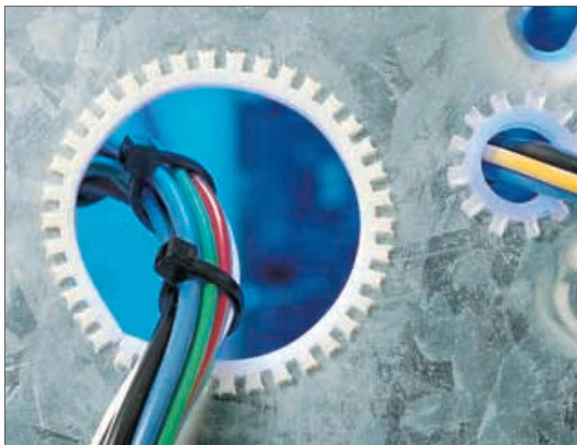
Optimal protection of cables and wires at panel edges.

Flexiform grommet strip is used to protect cables routed through sharp-edged cut-out sections.