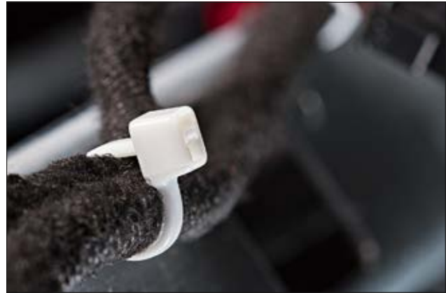
White T-Series cable ties for higher fire protection (PA66V0).