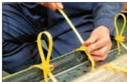
Excess Tails can be neatly tucked away.