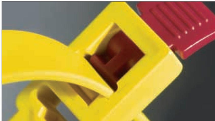
Patented quick release mechanism for quick and easy application.

The versatility of the SpeedyTie® means that it is suitable for a multitude of applications. Originally developed for the "offshore" industries, other uses include: construction, electrical installations, scaffolding sheet installations, exhibitions, trade fairs, and many more.