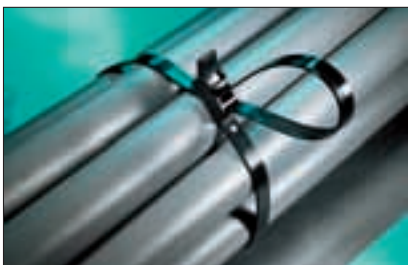
SpeedyTie® - Quick and easy.