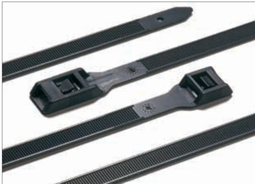
RPE, PE Series.

Coloured versions of PE400 are ideal for securing foam padding to playground equipment, by effectively applying the tie 'inside out'. This ensures there are no sharp edges and ultimate safety. PE400 can also be colour matched for any application.