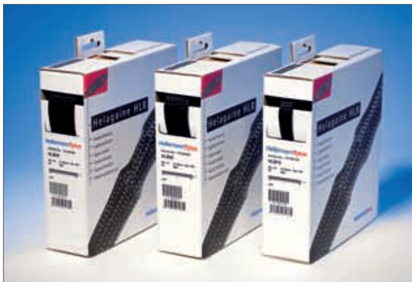
Helagaine HLB: The expansion rate makes it possible. Only three sizes in a handy dispenser box for almost all standard diameters.

To prevent fraying, the sleeve is cut with a hot-cutting tool, which melts and cleanly fuses the ends of the yarn