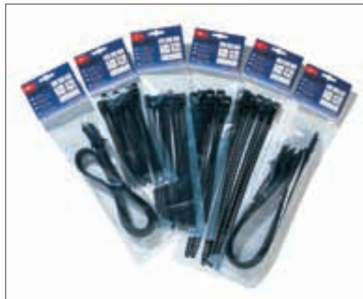
SOFTIX ties available in small quantities.