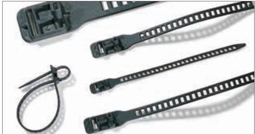
The Elasticity of the SOFTIX ties makes them suitable for use in many applications.

The SRT range offers solutions to numerous bundling applications. The soft, flexible material makes these ties particularly suitable for use on data and fibre-optic cables. The elasticity of the material makes them ideal for securing young trees to support poles, and other applications within the gardening and landscaping industry.