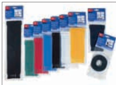
The TEXTIE®-Series is available in different colours and lengths.

GTM-Series Mounts for fixing are available on request. Please contact us!