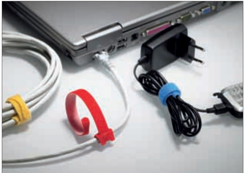
Due to the functional cable tie design the TEXTIE® is fixed on the cable and can't get lost.

There are a lot of private and office applications, too.