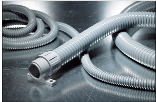
FlexiGuard FG with FG-UH fitting.