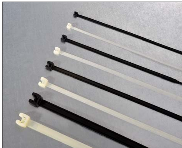
Q-tie cable ties: choose from a wide product range in different materials.

For detailed information on Application Tools please refer to page 15.