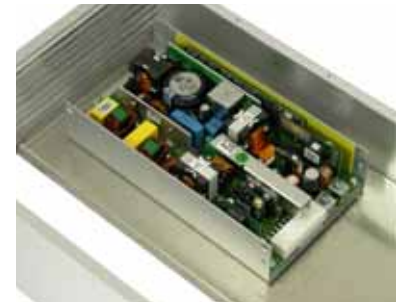
High stability with aluminium profile side panel