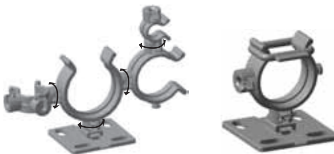
Multiple clips can be joined. Clips swivel freely.