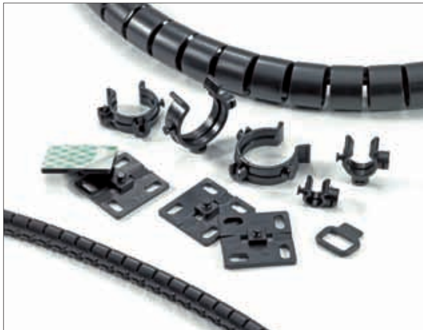
The Helawrap accessory set for bundling, fixing and protecting multiple cable runs.

Helawrap clips and mounting plates can be linked into chains to bundle, protect and fix any number of cables on industrial machines. They can also be used in wiring cabinets, particularly in the door area where movement is a requirement. Helawrap accessories are also used to manage cables in the office or home.