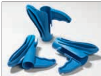
Applicator tools HAT are available for every Helawrap cover size.

The new Helawrap applicator tool enables the user to bundle cable rapidly and effortlessly. The applicator tool has been optimised to glide smoothly through the cover and allows easy insertion of cable into Helawrap. The unique design also allows individual cables to be removed from the applicator tool and branched off through the cover apertures. A tool is included with every Helawrap package. Additional tools can be purchased separately.