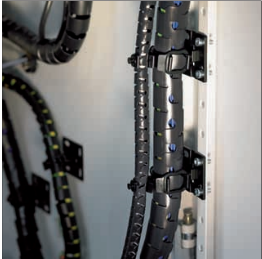
Protecting and fixing cables with the Helawrap cable cover and accessory set, for instance in wiring cabinets.