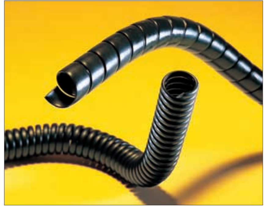
SPS and SPF Spiral Binding.

SPS and SPF are used to route and protect cables and wires in the automobile and petrochemical industries as well as in other heavy industries. The polypropylene material is highly resistant to oil.