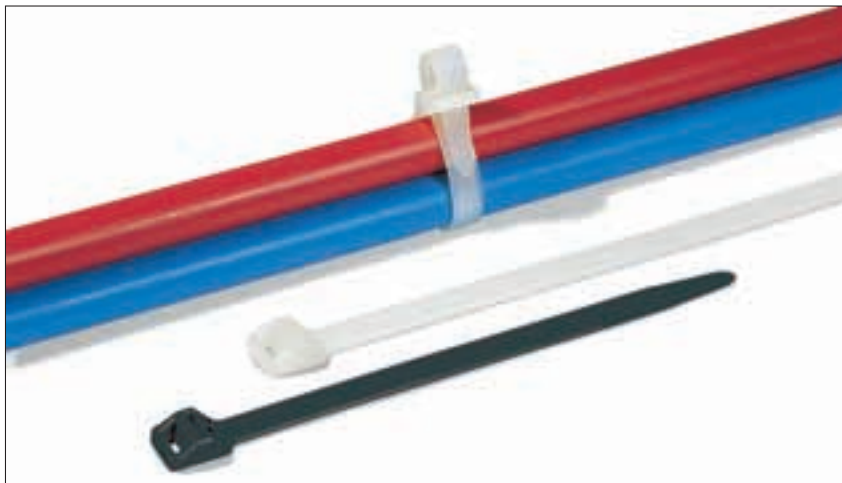
Ideal for larger or heavier bundles these ties can be opened and reused.

These ties are ideal for larger or heavier applications.