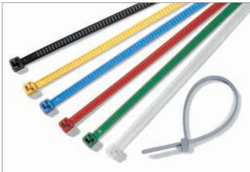
The LR55 cable ties are reusable and ideal for colour coding.

These releasable and reusable ties are ideal where temporary installation or the addition or removal of cables is required, for example: logistic identification (colour coding), packaging industries, cable harness manufacturing.