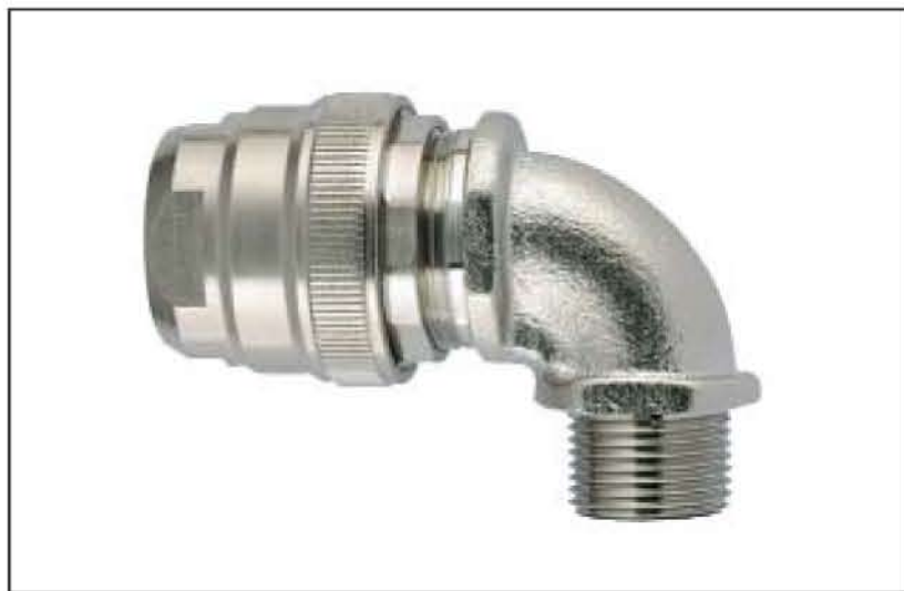
HelaGuard PCSB-90FMC Swivel Compression Fitting.